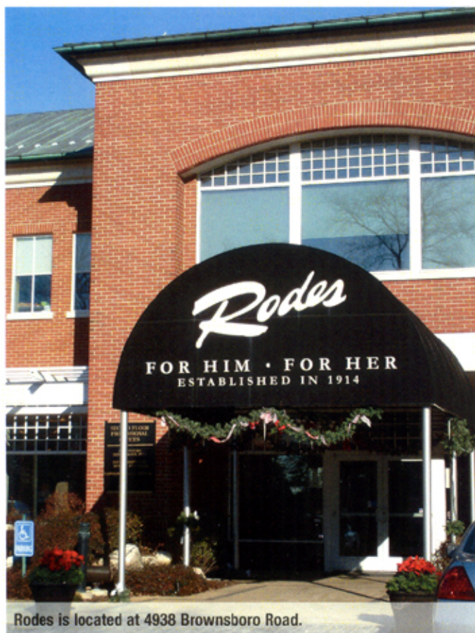
Rodes is located at 4938 Brownsboro Road.